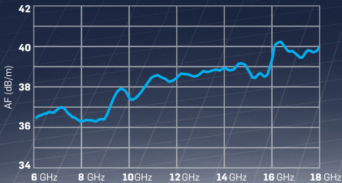
DR-01 - Antenna Factor